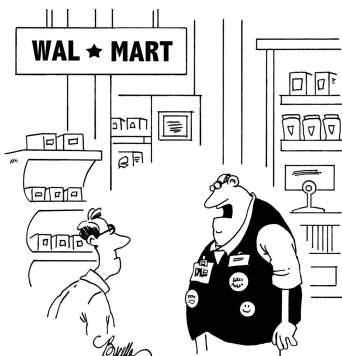
"Welcome to Walmart. Shopping or just taking photos of people?"

New data by lenders shows that some consumers overestimate what they need to qualify for a home loan. Two-thirds think they need a credit score over 780, which is considered excellent, but a credit score of 660 or above is considered good. Some 36 percent think they need 20 percent down, but this is usually not the case.