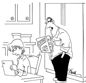
"Do we have any low calorie food? The doctor told me to stick out my tongue and say, 'Oink.'"