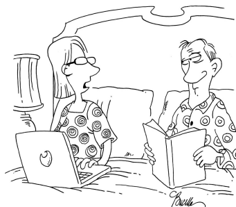
"Have you ever thought of having yourself digitally restored?"