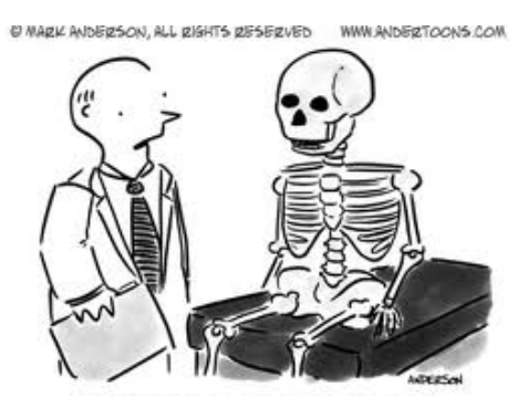
"Still, let's do an x-ray just to be sure."