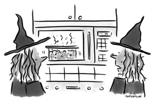
"It's faster, but the cauldron tastes better."

It's never too late to start improving your fitness level with exercise and other healthy habits.